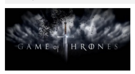
The Second Watch: Letting go of the past